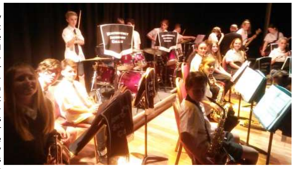
Rookie Band on stage and waiting for the curtains to go up

While the students had some opportunity to hear their peers on concert night it isn't always possible to see the entire concert and hence not all performers and friends. To help students develop individual performance skills and share their individual work with their peers the students get the opportunity to play for each other. This was a fabulous event and it was wonderful to see various combinations of instruments from solos to trios (eg Double Bass, 2 Violins), bass Guitar Trio, Guitar ensemble, Ukulele and voice and many more. Some students were very enthusiastic even as audience members (!!!) but everyone seemed to have fun. On the lunch bell we all indulged with some pizza to end the event.